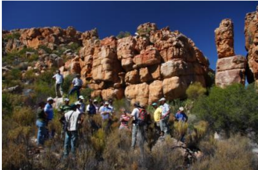
At the site where a leopard once ate a Klipspringer