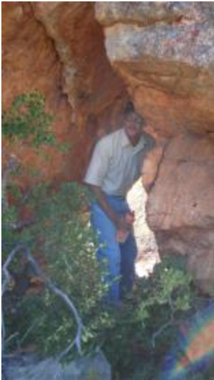
The route took us right through the rocks