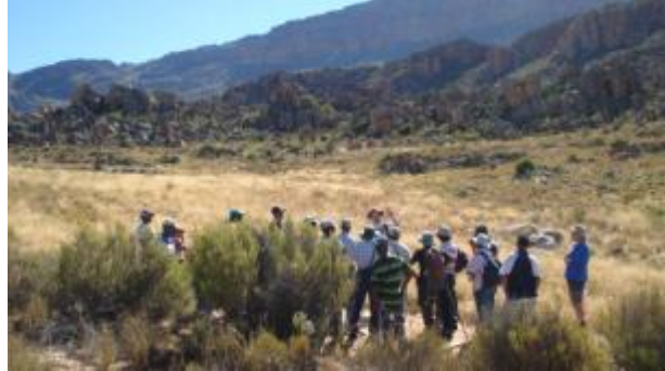
Quinton showing the group some of the finer points of tracking